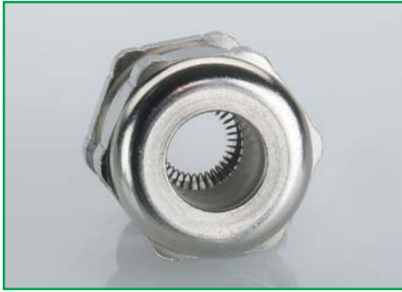
With Thermoplastic Elastomer (TPE) Sealing Insert