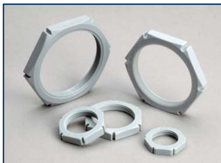
Polyamide (PA) Light Gray