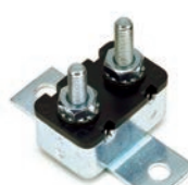
30128 - with studs and cross-bracket