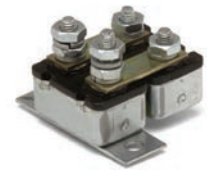
3088, 30507 - double breaker assembly