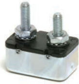
30056, 30137, 30171 - with studs, no bracket

Additional information: littelfuse.com/CircuitBreakers