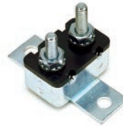
30128 - with studs and cross-bracket