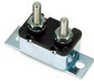
30055, 30138, 30172 - with studs and bracket