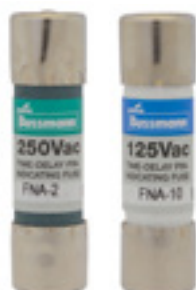
250Vac 1/10 to 6A 125Vac 6-1/4 to 10A