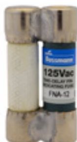
125Vac 12 to 15A