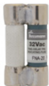
32Vac 20 to 30A