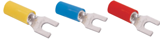
Nylon-insulated locking forks