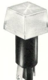
With Square Lens