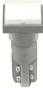
Rectangular (R) 18 x 24 mm